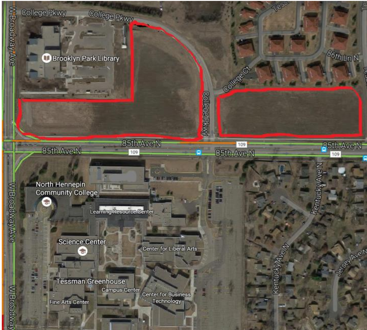
North end of campus, showing NHCC-owned property north of 85 th Avenue North (circled) and Hennepin County Library.

Federal Law requires this report to cover statistics of incidents occurring in three areas: On Campus, Off-Campus, and Public Property.